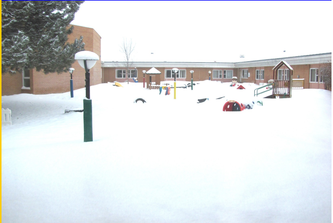
NMCDC 0 - 3 PLAYGROUND